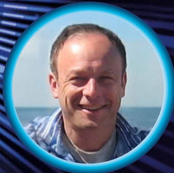
Antony Oliver Infrastructure Podcast