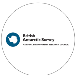
British Antarctic Survey

This new award recognises the crucial role of clients who commission and champion outstanding projects in the built and natural environments.